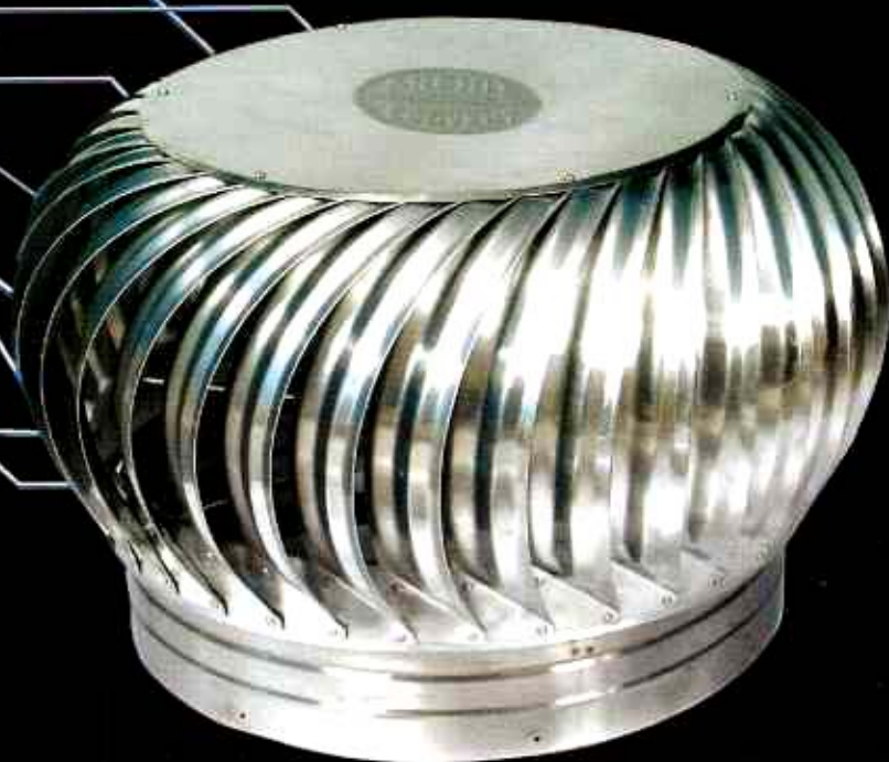
EV 28 A